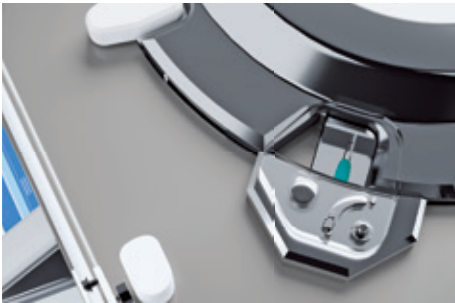
VibraFix-module for tablet positioning