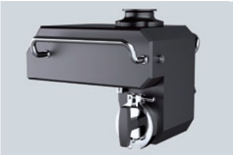
Tablet dust removal, optional via suction