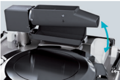
SmartFeed – new singulation system with automatically adjustable inclination of the singulation groove