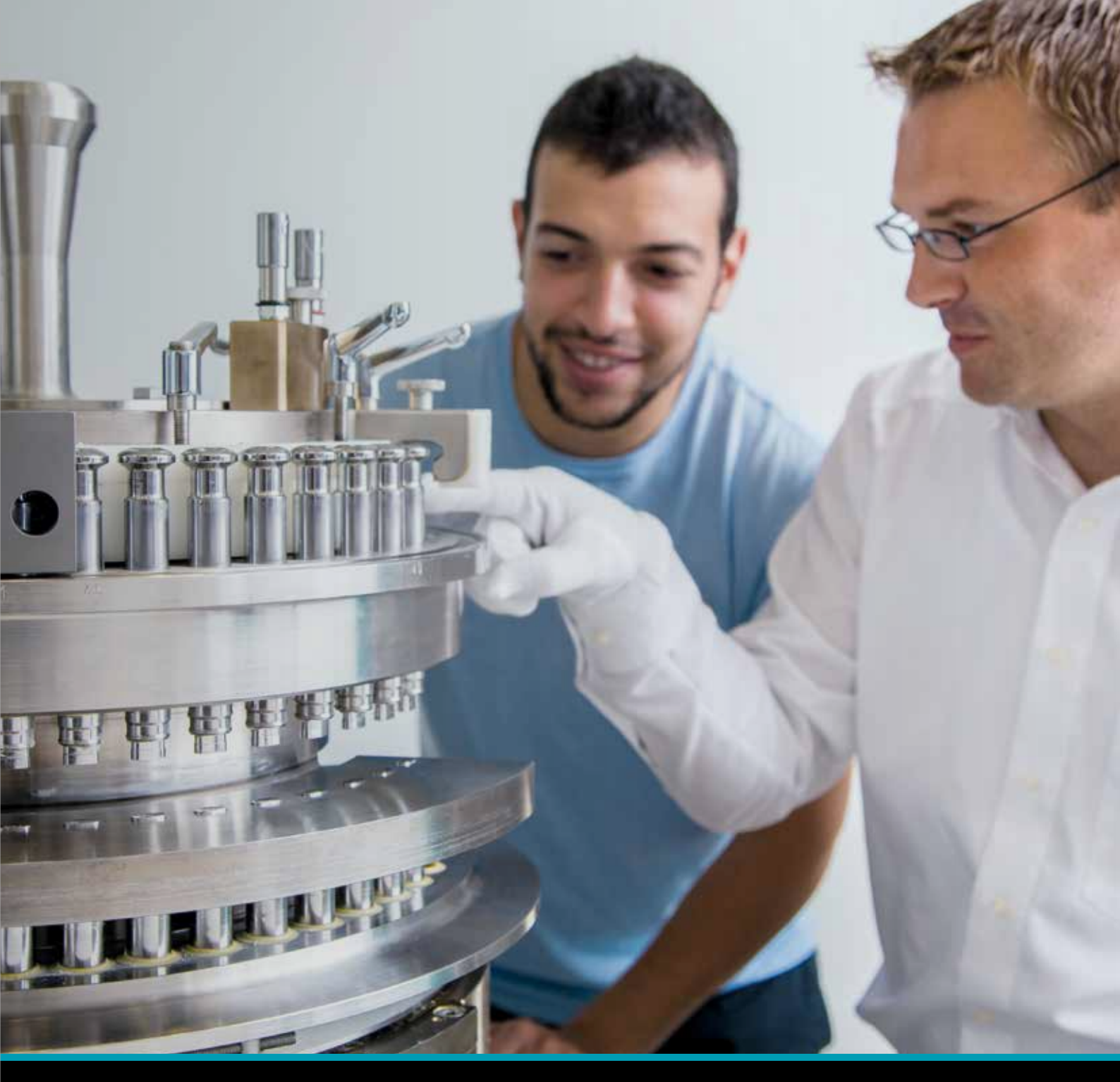
Global Training Program